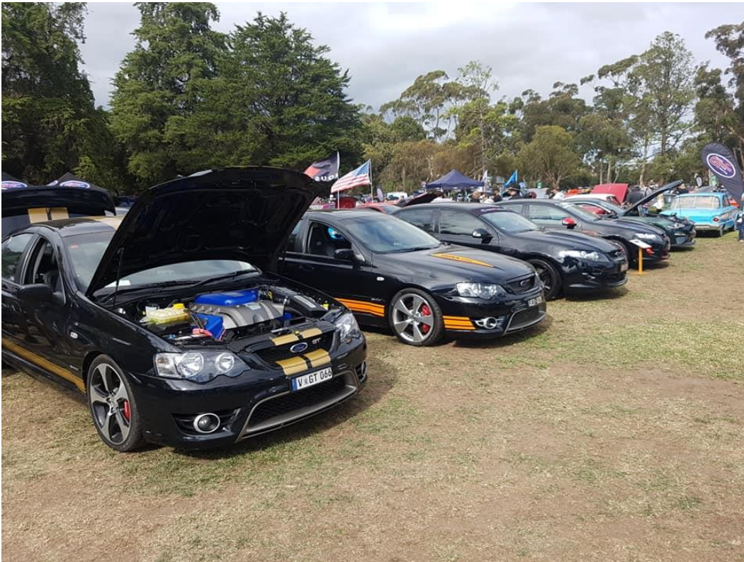
Left:- Late Model FPV GTs on display at All Ford Day.