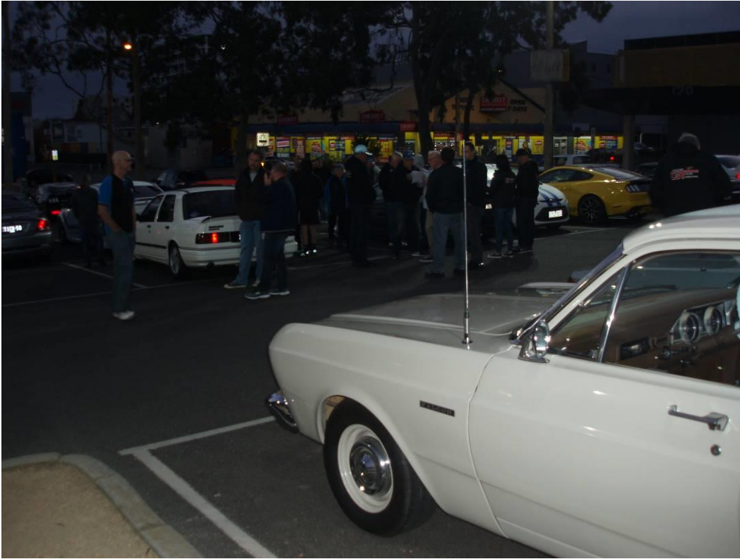
Left:- Club Meeting Point awaiting departure, 6:30 am.