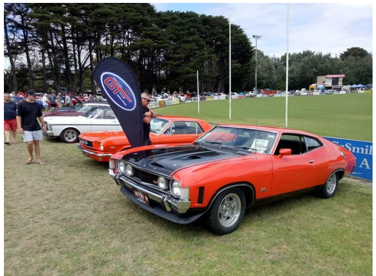
Right:- Line-up of Club Cars on display at Drysdale.