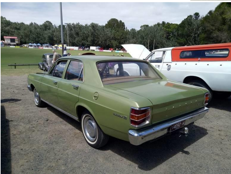
Left:- Nice original XW Falcon on display at Drysdale.