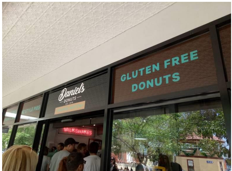
Right:- Once last stop before heading home..... 😊