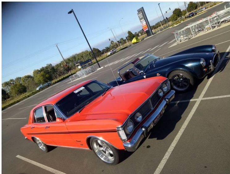
Left:- Ross's XY Fairmont GS and Cobra Replica at Bunnings Leopold Meeting Point.