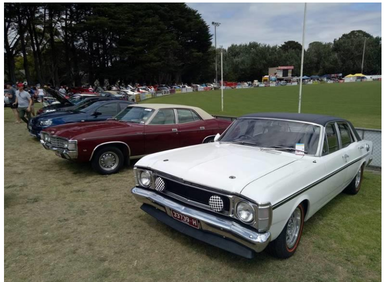
Right:- Line-up of Club Cars on display at Drysdale.