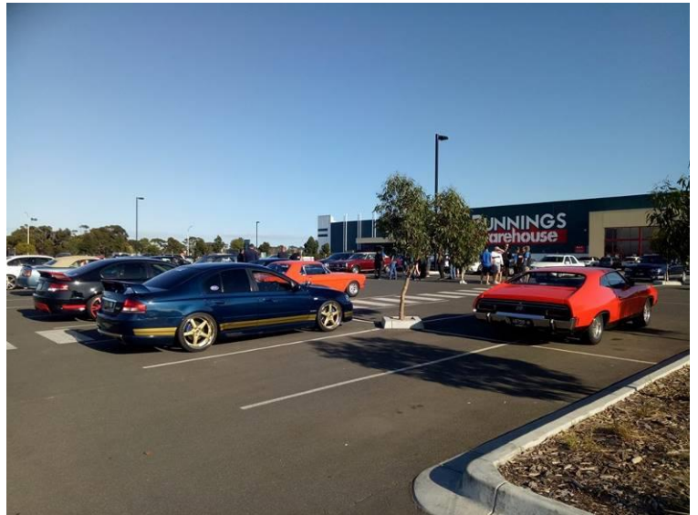
Right:- Meeting Point at Bunnings Leopold.