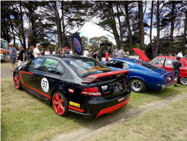
Left:- Line-up of Club Cars on display at Drysdale.