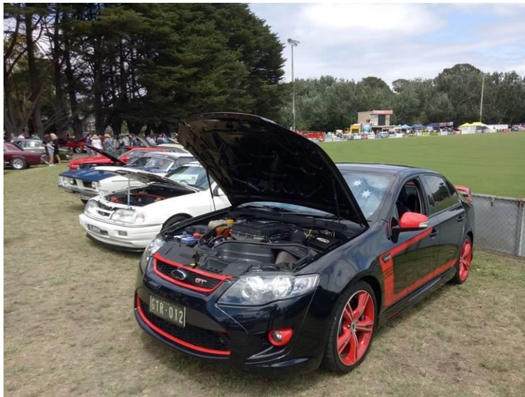
Left:- Line-up of Club Cars on display at Drysdale