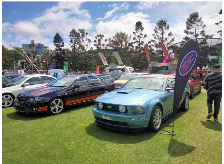
Right: Club Cars on display on Steampacket Lawn