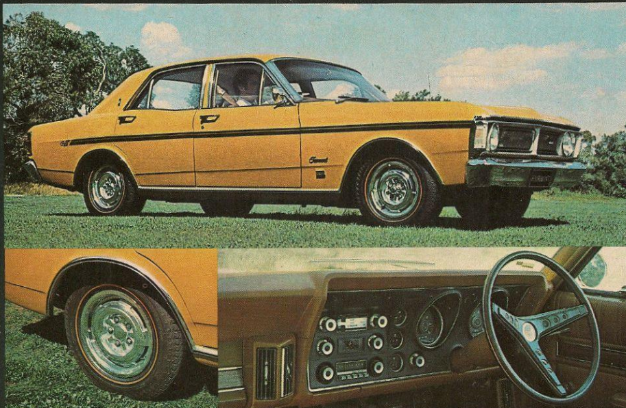
Illustrated: Fairmont Sedan with G.S. Rally Pack

For looks: Gleaming chrome sports wheel covers; G.S. Rally Stripes sweeping to the special "G.S." badge. For driving: a sports world of your own, 3-spoked, wood-grained sports steering wheel; a fully instrumented cockpit dash with tachometer, odometer, oil, temperature and fuel gauges, speedometer and an electric clock. Everything for motoring in the Grand Sport manner. You can order the G.S. Rally Pack for Falcon, Falcon 500, Futura or Fairmont Sedan; Falcon 500 or Fairmont Wagon. You can have it