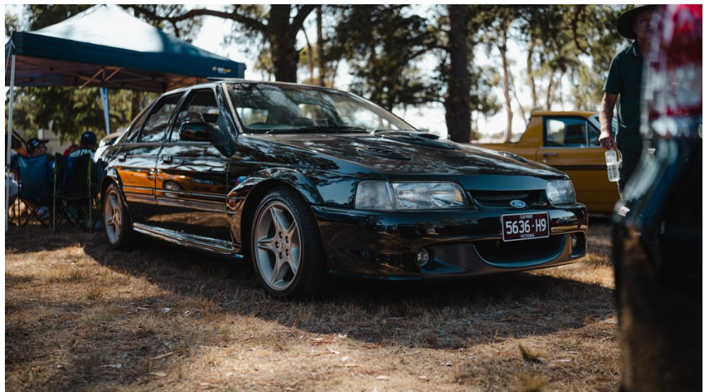
Right: EB Falcon GT