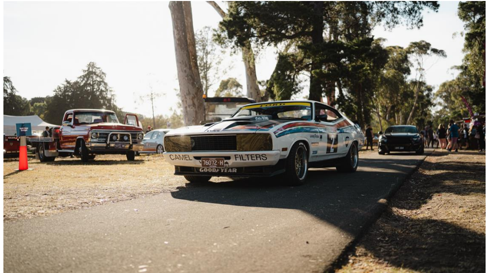
Right: XC Group C Falcon Hardtop Replica