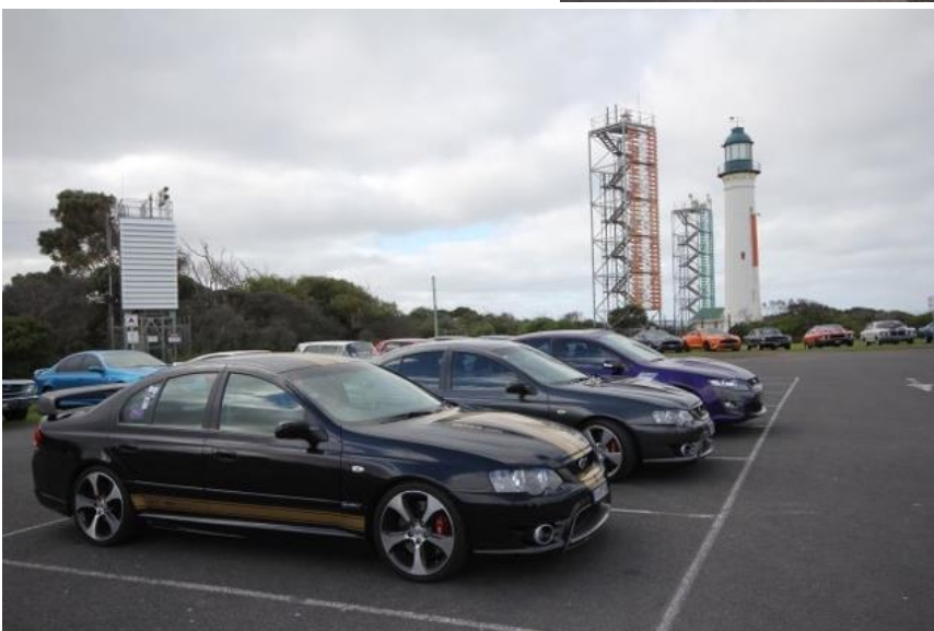
Left: Lineup of Club Cars at Queenscliff