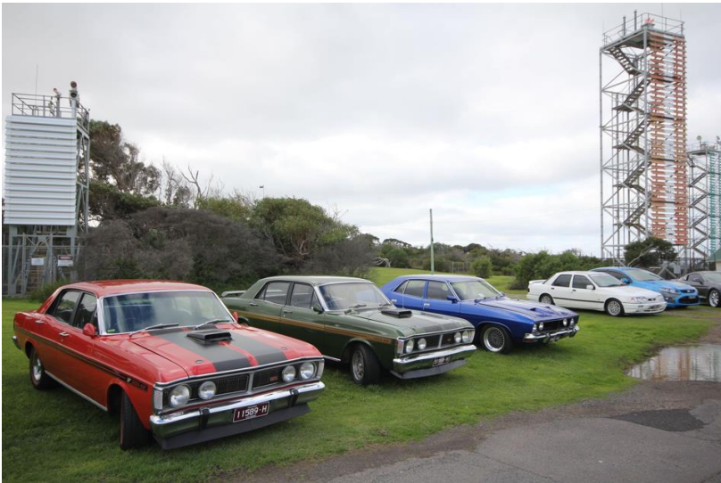
Left: Lineup of Club Cars at Queenscliff