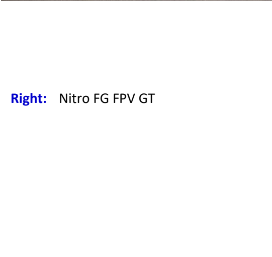
Right: Nitro FG FPV GT