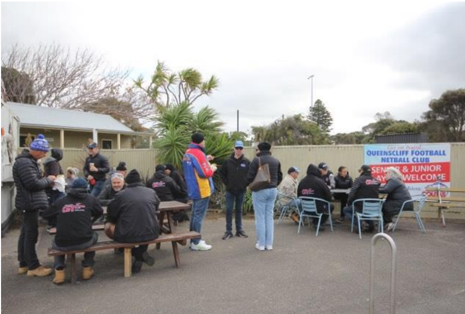
Left: Club Members at Queenscliff