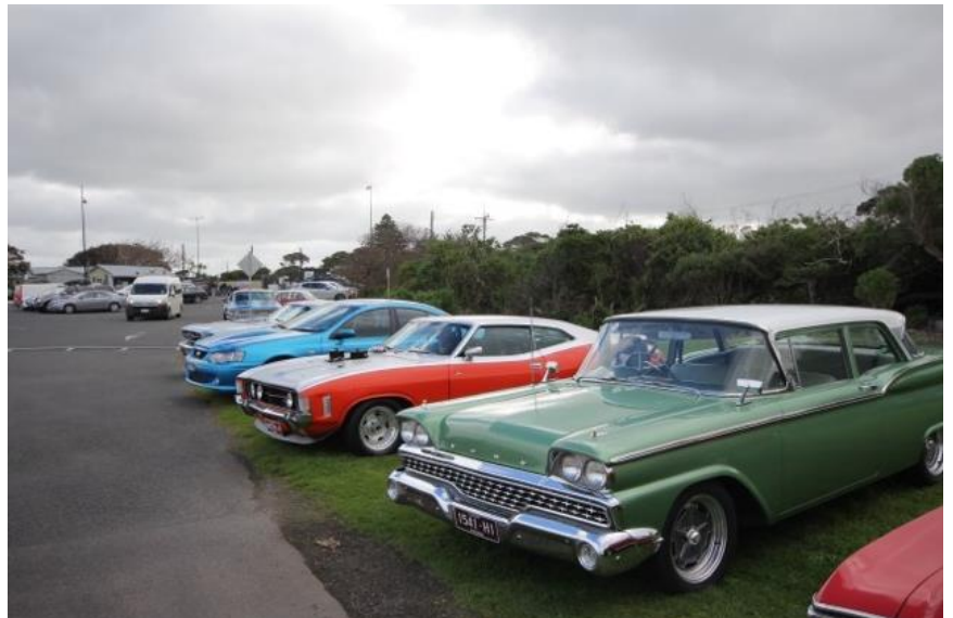
Right: Lineup of Club Cars at Queenscliff